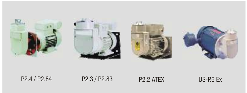
P2.4 / P2.84