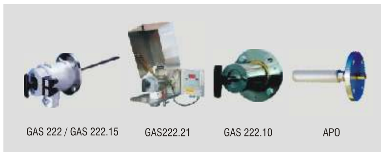
GAS 222 / GAS 222.15